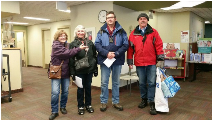
Some brave attendees

True to the learning process, there was confusion at